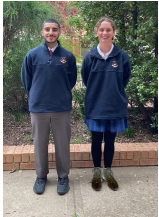
Senior Winter Uniform