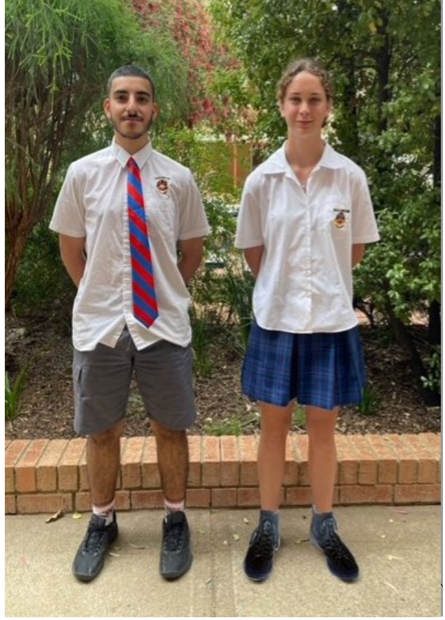
Senior Summer Uniform