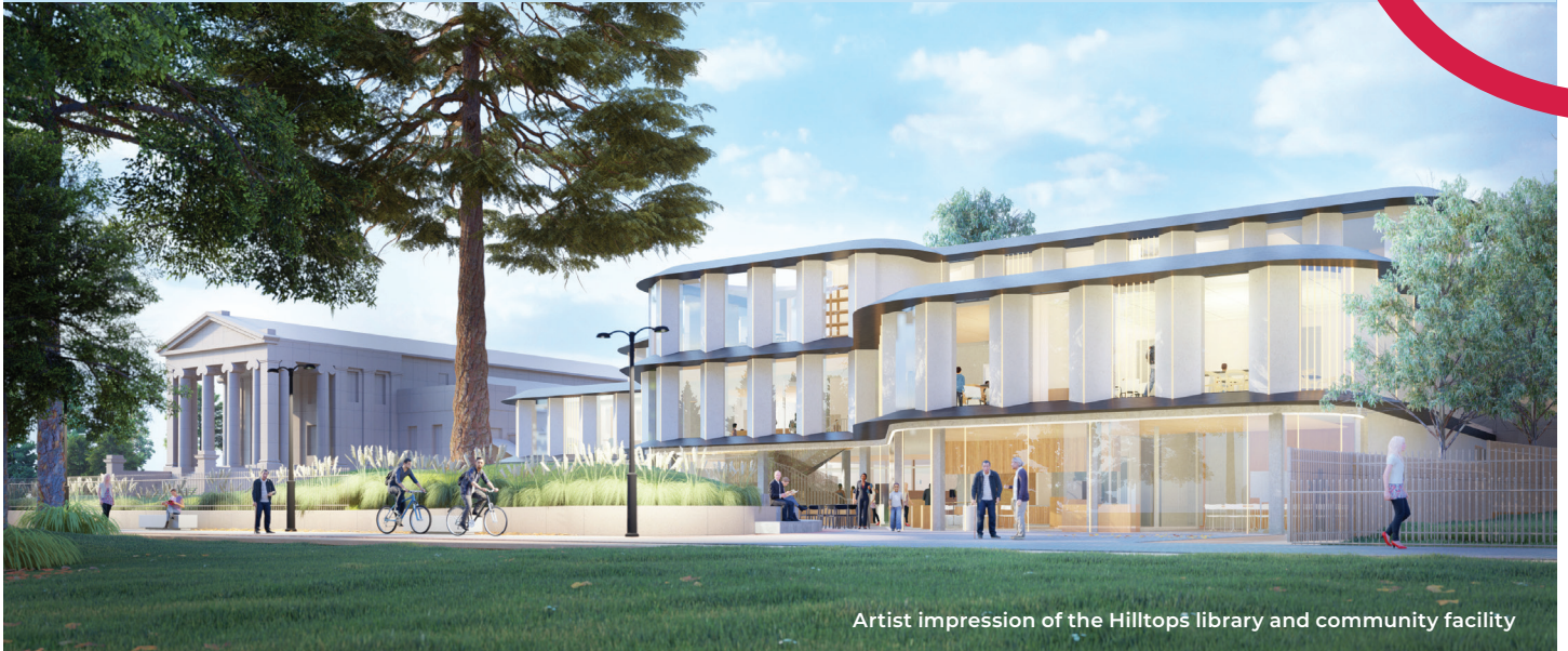
Artist impression of the Hilltops library and community facility

The NSW Government is investing $7 billion over the next four years, continuing its program to deliver more than 200 new and upgraded schools to support communities across NSW. This is the largest investment in public education infrastructure in the history of NSW.