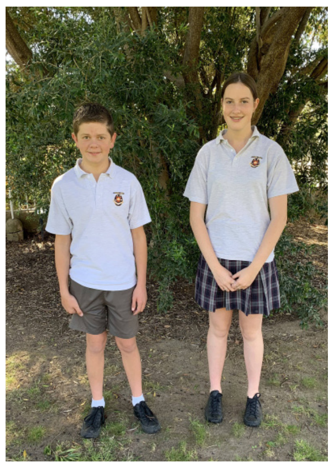
Junior Summer Uniform