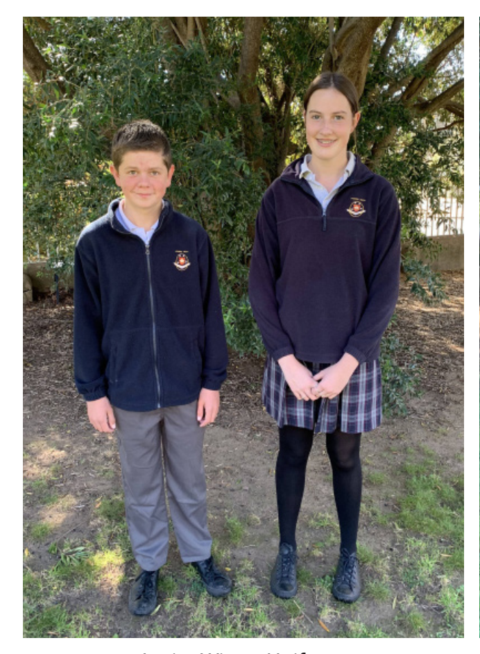
Junior Winter Uniform