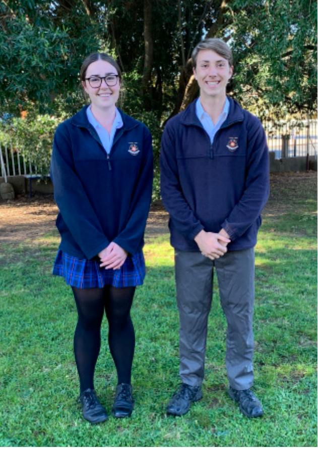
Senior Winter Uniform