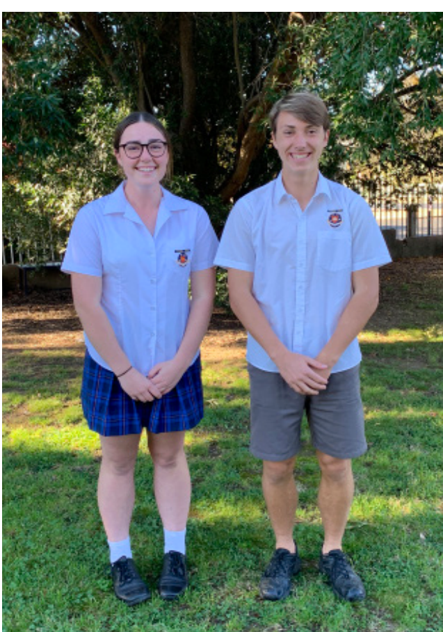
Senior Summer Uniform