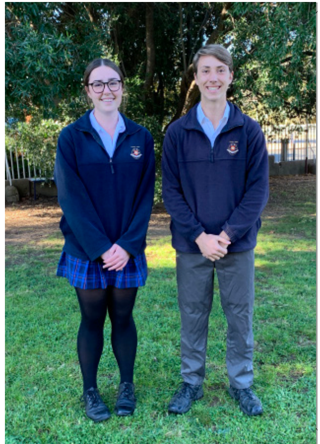
Senior Winter Uniform