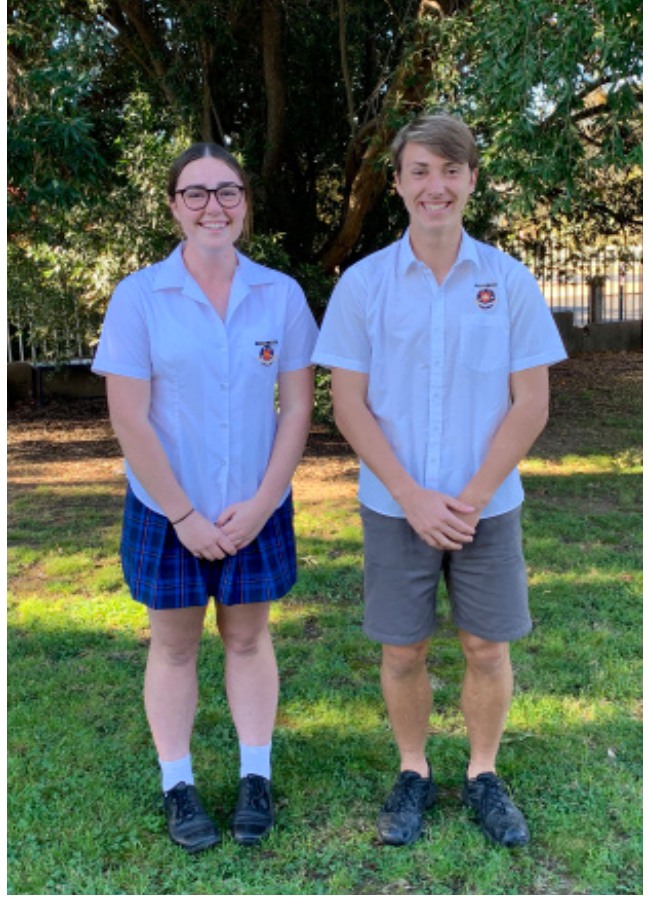
Senior Summer Uniform