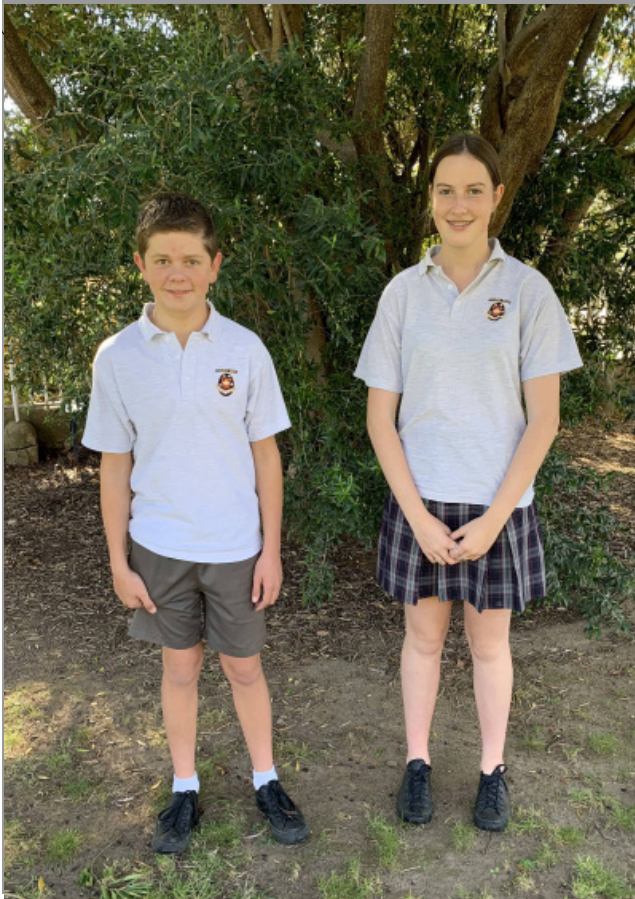
Junior Summer Uniform