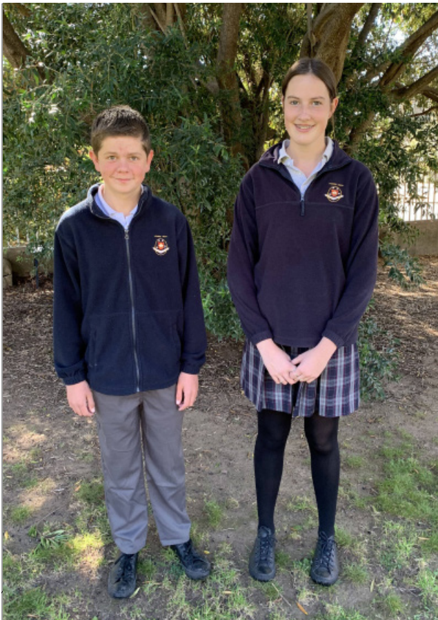
Junior Winter Uniform